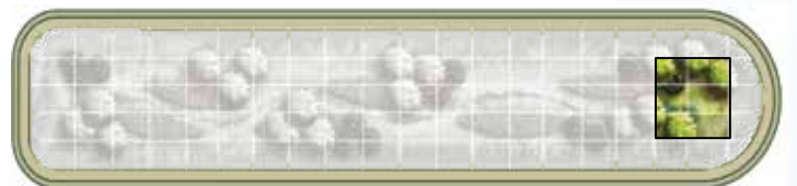
FocalPoint Biofiltration System

The FocalPoint Biofiltration System is a combination of a high performance flat pipe underdrain, a bridging mesh that is clog proof, bridging stone, and a high performance biofiltration media that flows at a rate of over 100" per hour. What this unique combination of parts creates is a system that provides unsurpassed water quality and drainage characteristics. For the purpose of Birnamwood Drive, FocalPoint was able to do in 2,000 SF what the traditional bioswale design would have required a full acre of biofiltration surface area to accomplish.